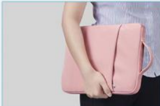
Tablet PC bag