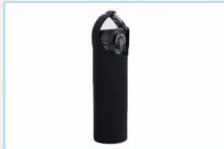
Water cup cover