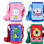
Water cup cover