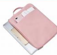
Tablet PC bag