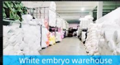
White embryo warehouse