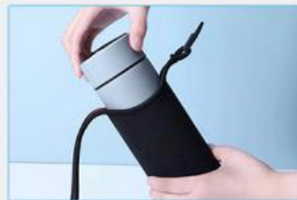
Water cup cover