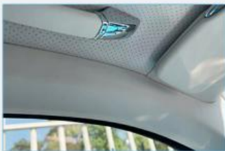
Car roof liner