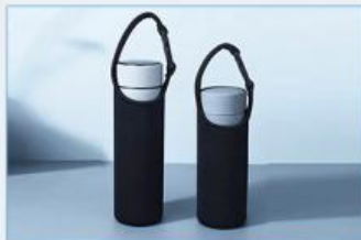
Water cup cover