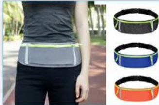
Sports waist bag