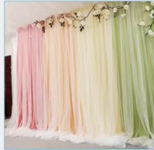
Stage decorative cloth