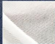
NYLON GREY FABRIC