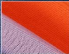
SINGLE JERSEY FABRIC