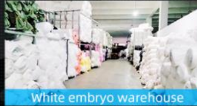
White embryo warehouse