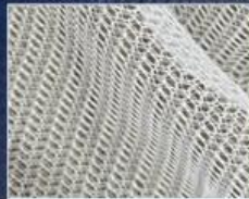
MESH GREY FABRIC