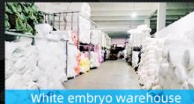
White embryo warehouse