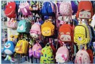
Sports waist bag