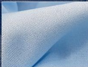
100% POLYESTER FABRIC