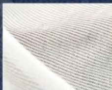
NYLON GREY FABRIC