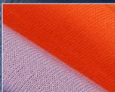
SINGLE JERSEY FABRIC