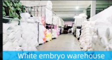
White embryo warehouse