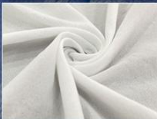
100% NYLON GREY FABRIC