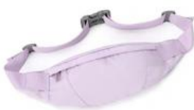
Sports waist bag