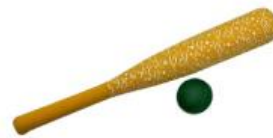
Baseball bat cover