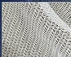
MESH GREY FABRIC